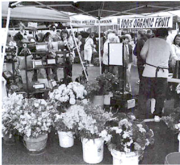
The Farmers Market, located at the south end of the Des Moines Marina, is open Saturdays from 10 a.m. to 2:00 p.m. through October 28th.

Development and land use permits are at an all time high. In the last 12 months, the number of building permits applied for and issued has increased by over 12%. In a city of 30,000 residents, over 400 new building lots are being reviewed.